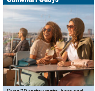
Over 30 restaurants, bars and coffee shops offering a range of menu options, many with waterside views.