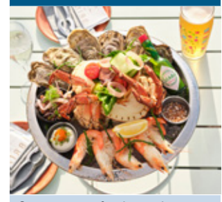
Great range of independent restaurants and bars offering food from across the globe - including seafront eateries and fish and chip restaurants.